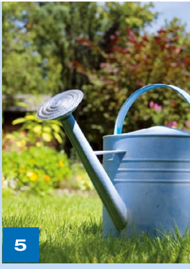
Done. The tank is ready for storing rainwater immediately after the piping connections have been installed.