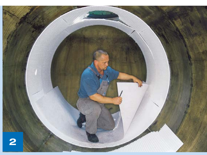
Depending on the condition of the tank, a fleece layer is placed on the tank floor, for example, for impact protection.