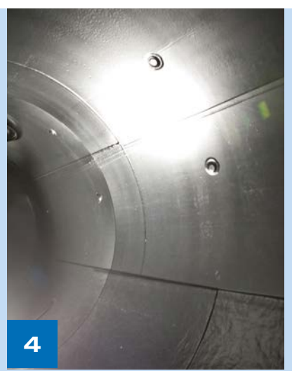
The fit of the PVC lining is checked and then it is fastened in the manhole by means of a fastening ring